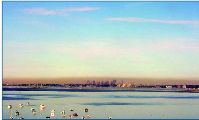
Particles contribute to haze, such as this brown haze over Boston.

A irborne particles, the main ingredient of haze, smoke, and airborne dust, present serious air quality problems in many areas of the United States. This particle pollution can occur year-round—and it can cause a number of serious health problems, even at concentrations found in many major cities.