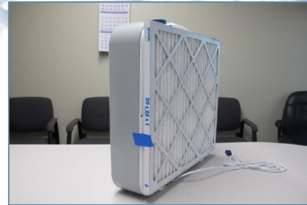
This simple fan-filter combination can reduce the amount of the tiny, harmful particles in the air.

Paper "comfort" or "dust" masks – the kinds you commonly can buy at the hardware store – are designed to trap large particles, such as sawdust. These masks generally will not protect your lungs from the fine particle in smoke.