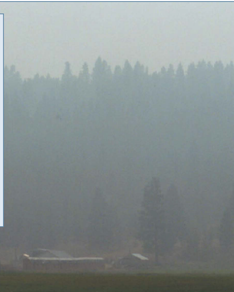
Smoke in Bitterroot Valley, Montana, August 2002.

Fires can be a threat to life, natural resources and property. But flames aren't the only danger. Smoke also can be a threat to your health.