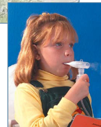
Children with respiratory diseases should be monitored closely during smoke alerts.

If smoke is affecting your area, check the Fire and Smoke map ( fire.airnow.gov ) and your local media for information on how to protect your health.